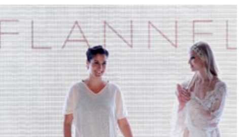
Winner of the New Generation Rockstar Award for Best New Designer Rosemount Australian Fashion Week May 2009